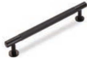
HA251, HA252, HA253