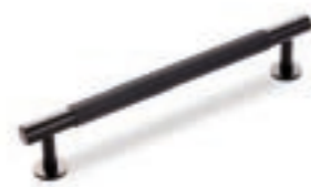
HA275, HA276, HA277