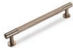
HA263, HA264, HA265