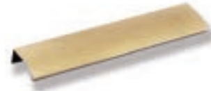
HA204, HA205, HA206