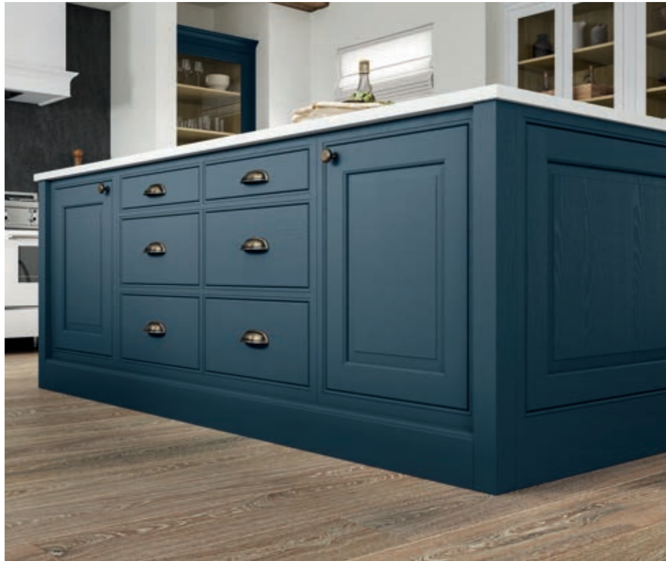
A central island featuring square pilasters and a moulded plinth offers a practical area for food preparation and coffee enjoyment.