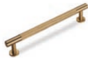
HA257, HA258, HA259