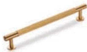
HA281, HA282, HA283