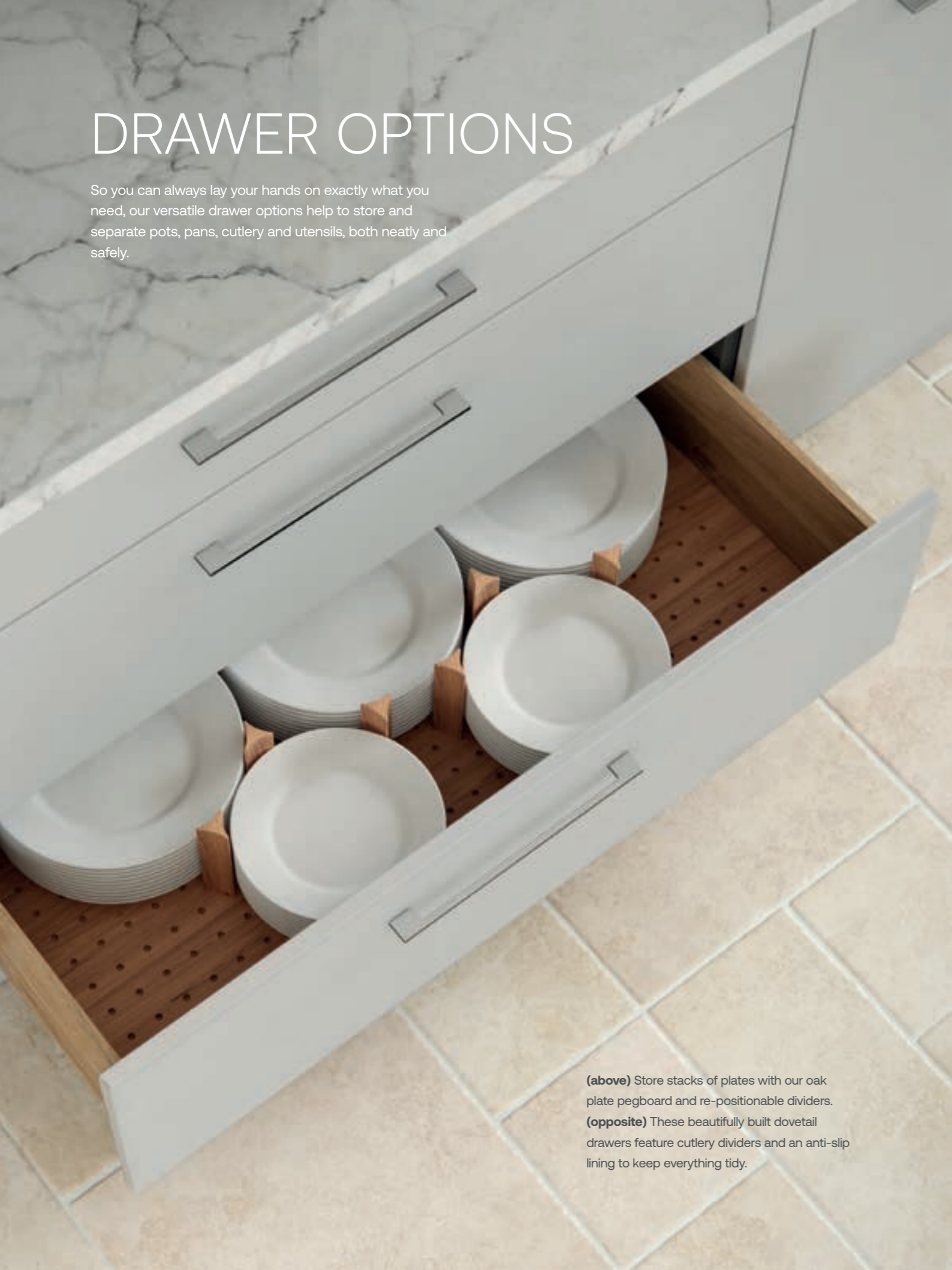
(above) Store stacks of plates with our oak plate pegboard and re-positionable dividers. (opposite) These beautifully built dovetail drawers feature cutlery dividers and an anti-slip lining to keep everything tidy.

So you can always lay your hands on exactly what you need, our versatile drawer options help to store and separate pots, pans, cutlery and utensils, both neatly and safely.