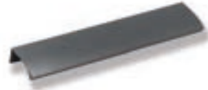
HA201, HA202, HA203