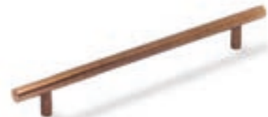
HA156, HA157, HA158