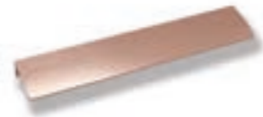
HA240, HA241, HA242