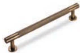
HA245, HA246, HA247