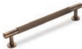
HA269, HA270, HA271