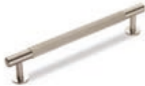
HA287, HA288, HA289