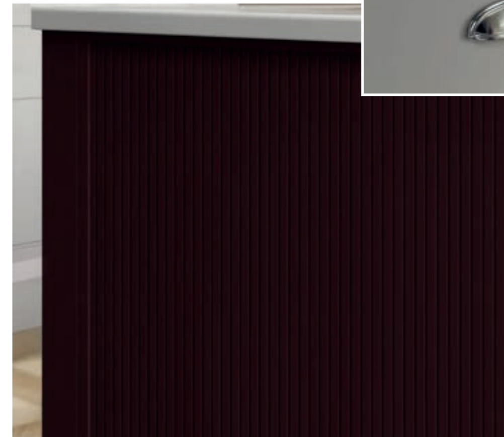
Featured handles: PH17 and PH19